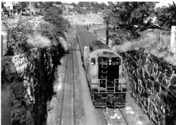
A Diesel locomotive pulling one of the last trains to enter Woods Hole, in 1963. View from bridge to Juniper Point with Little Harbor in the background. The Ballantine property is to the right just beyond the stone abutment.

ally active, expanding their vision to include a northward extension to the Cape Cod Canal and even a Cape-wide network of bicycle paths. They wrote and talked to county and state officials, communicated with the Cape & Vineyard Electric Co. about possible conflicts between bike paths and power lines and visited Stanley C. Joseph, superintendent of the National Seashore, which was then in the process of creating bike trails through the Province lands — the first in any national park. They explored the possibility of state and federal funding to help with the acquisition of land or construction of pathways.