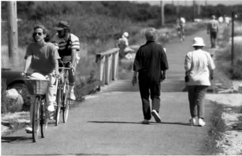
A busy day at Trunk River.

to town meeting approval. Dr. Ballantine came back with another town meeting article, to sell the town the stretch from Nobska Road to Falmouth for $60,000 but keep the portion along Little Harbor and the parking lots. The article was submitted late and lacked the required signatures but selectmen voted to insert it in the warrant for the special town meeting to be held in conjunction with the annual meeting. By then the Finance Committee had recommended indefinite postponement of the two earlier articles.