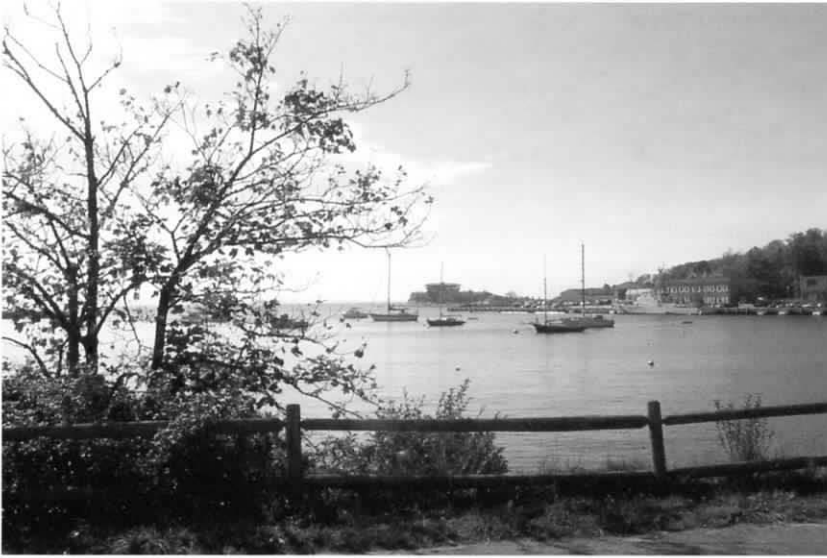
View of Little Harbor from the bike path. Coast Guard station is on the right with Airplane House on tip of Juniper Point showing in the center.

was defeated by a lopsided voice vote. The two articles to rescind the taking were likewise voted down. Within a week the Ballantines filed suit in Barnstable Superior Court, seeking to overturn the taking. With the matter now before the courts, not much could be done about the bike path itself, although the Steamship Authority went ahead with a planned resurfacing of the parking areas and the connecting strip along Little Harbor. Many townspeople moved on to other pressing matters such as the need for a municipal sewage treatment plant.