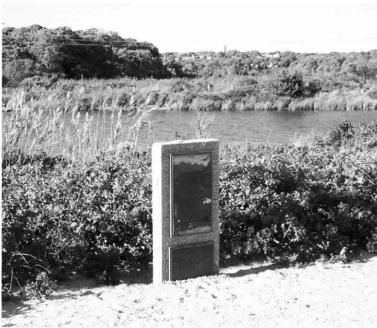
Replica of Pikes Peak plaque honoring Falmouth native Katharine Lee Bates for her song, "America the Beautiful," stands alongside the bike path by Oyster Pond. The Shining Sea Bikeway's name comes from the lyrics of "America the Beautiful."

at Trunk River. What a way for a committee of volunteers to appreciate the value of their work! The August 2001 meeting was held on a perfect summer evening, the bike path teeming with hand-in-hand walkers and families out for a stroll, evening bikers and bladers. Swimmers ventured into the still evening water, while nearby fishermen tried their luck from the beach and jetties and a few readers made the