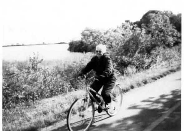
Happy smiles and scenic vistas lift spirits all along the bike path.