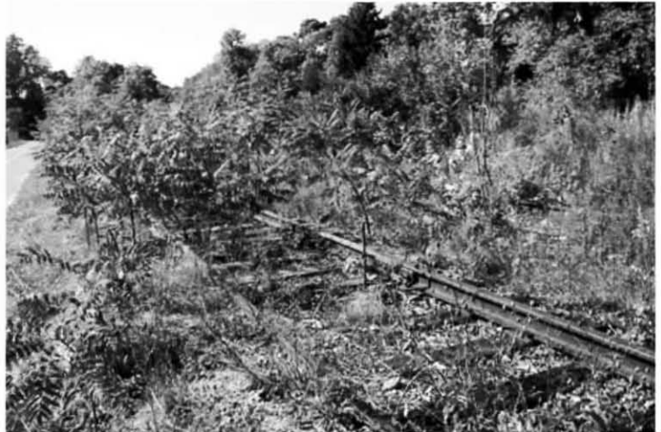
Rail at siding near former Grain Mill shows through weeds alongside bike path extension.