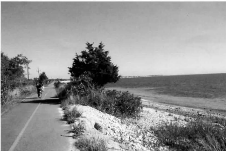
Quissett beach belonging to Woods Hole Oceanographic Institution on right with Falmouth Heights in background. The beach was once part of the Fenno estate which now comprises the WHOI Quissett campus.