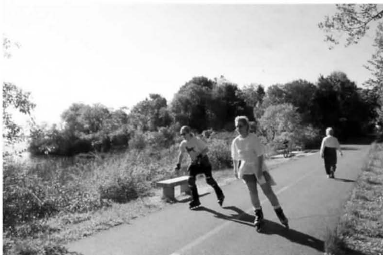
Roller bladers and lone walker pass Salt Pond.

He gave a convincing demonstration of those skills that fall, when one of the main carrying timbers of the Church Street bridge (built in 1879) was found to be cracked. Emergency repairs were necessary.