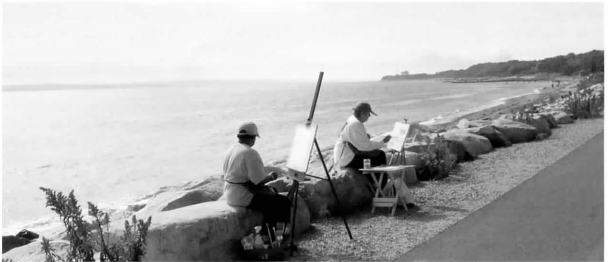
The scenic beauty of the Shining Sea Bikeway attracts artists as well as recreational users. Nobska Light beckons bike path users to Woods Hole as they traverse the stretch from Oyster Pond past the Quissett beach and Trunk River inlet into the woods.

The Enterprise weighed in a few days later with an editorial strongly supporting the idea of a walking and bicycling path, followed shortly by an article describing a walk along the 3.1-mile neglected railbed. Rampant poison ivy, broken glass, washed-out sections were found, but also magnificent vistas, marsh plants and abundant birdlife. The editorial also noted, presciently, that such a long level stretch might prove useful when the town eventually came up with a solution to the need for municipal sewerage.