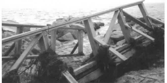
Damage to bike path after Hurricane Bob, August 19, 1991.