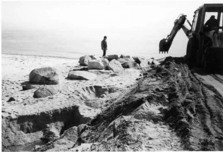
Bike path repair near Trunk River.

owned substantial frontage on the right of way. (The Oceanographic Institution had recently acquired the Fenno estate in Quissett, now WHOI's Quissett Campus, including about half a mile on both sides of the railbed. The MBL owns property that abuts the right of way for about the same distance near its